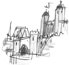
River Thames Murder's Tour