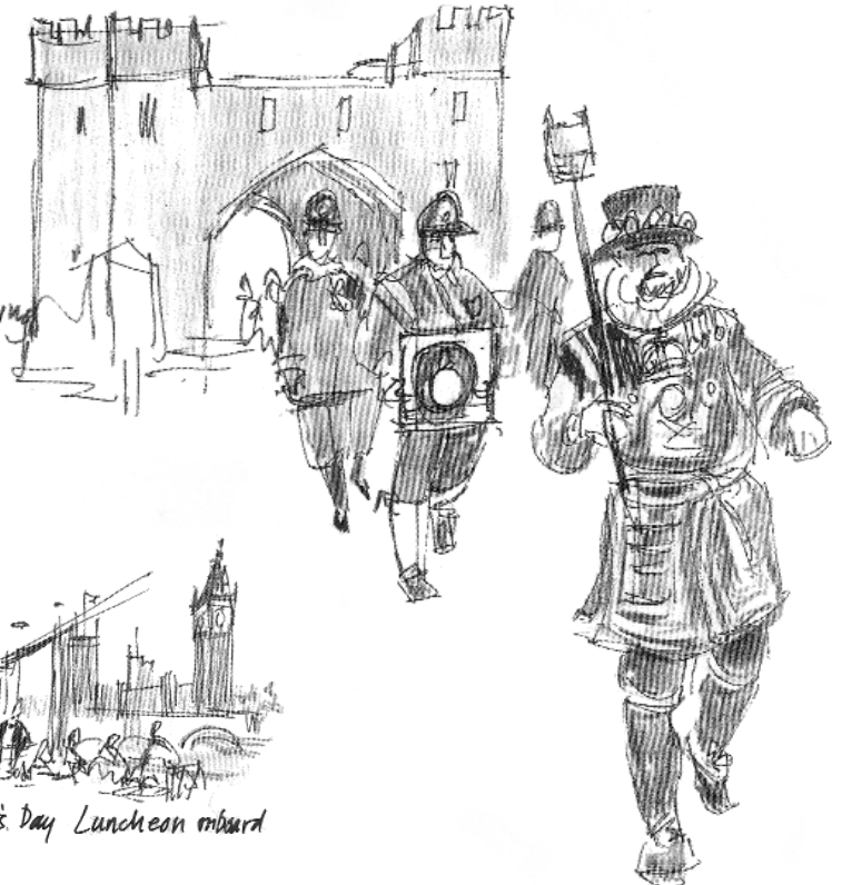
The Tudor Row - an annual event rowed from Hampton Court to the Tower of London where the 'Slea' is presented to the Governor for safe keeping