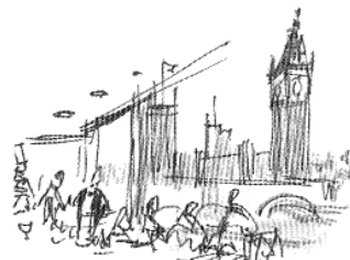
Mother's Day Luncheon onboard